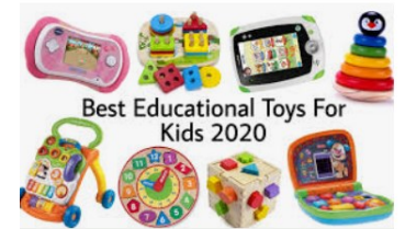
Best Educational Toys For Kids 2020