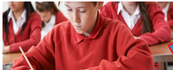
Written quizzes, "cold" work